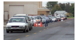
CARS LINE-UP ON 7TH TO RECEIVE A FOOD BOX

SEICAA Community Services welcomed Feed the Children on Saturday September 20, 2008 for the second time. Teleperformance USA sponsored the semi-truck load of food to benefit 400 families in Southeastern Idaho. SEICAA distributed 400 vouchers throughout Bannock, Bingham, Bear Lake, Caribou, Franklin, Oneida, and Power Counties. In order to reach those needing a food box, SEICAA also gave vouchers to the Salvation Army, St. Vincent du Paul, and Head Start. Families traveled from as far away as Soda Springs, Montpelier, and Malad to receive a 25 pound food box and hygiene items.