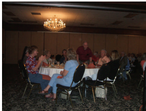
RSVP AWARDS BANQUET SEPTEMBER 6, 008

SEICAA Senior Services the 2008 RSVP Appreciation Banquet Saturday September 6, 2008 at 2:00 P.M. at the Red Lion Hotel. The theme for this year's banquet was "The Wind Beneath Our Wings," as the RSVP volunteers make such an impact on those they with whom they interact.