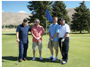
MONTPELIER GOLFING FOR FAMILIES

SEICAA's Bear Lake County Extension office hosted the Annual "Golfing For Families" Golf Tournament on Saturday September 13, 2008. This popular golfing event drew a packed course on a beautiful September morning. "Golfing for Families" was the 5th year of the charity golf even and raised $XXXX to assist SEICAA participants in Bear Lake County.