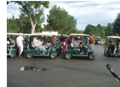
MEALS ON WHEELS DRIVING FOR DOUGH

SEICAA's Meals on Wheels welcomed the 2nd Annual "Driving for Dough" Charity Golf Tournament. Last year's tournament was cancelled due to a snow storm, and the weather on September 20 was very unstable; however, 14 teams golfed and numerous local businesses donated to the cause. Due to the dedication of Bannock County golfers and local business organizations, the tournament raised over $3200 for the delivery of meals in the Meals on Wheels Program.