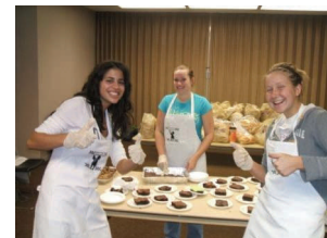
VOLUNTEERS FROM HIGHLAND JR. CIVITAN AT BANNOCK COUNTY STONE SOUP