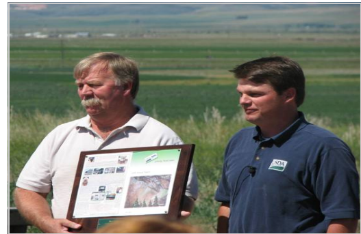
Groundbreaking in Montpelier, ID June 16, 2007