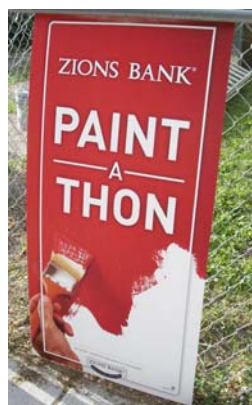
June 19, 2007

Employees of Zion Bank completed a community service project by helping with routine maintenance of an elderly Meals on Wheels participant's home. Zions Bank painted the exterior of the home, mowed and weeded the lawn, fertilized the yard to encourage grass to grow, decorated the yard with potted flowers, and re-hung a porch light. Zions Bank donates both time and money to help further community goals. Zion Bank represents the spirit of the community and SEICAA is fortunate to maintain such a great relationship.