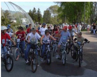
Student participants May 2007

over $2500.00 for the event. All student participants received a new backpack, toys, certificates, and those without helmets received one from SEICAA. The Bike-a-Thon was much anticipated and was enjoyed by all who participated.