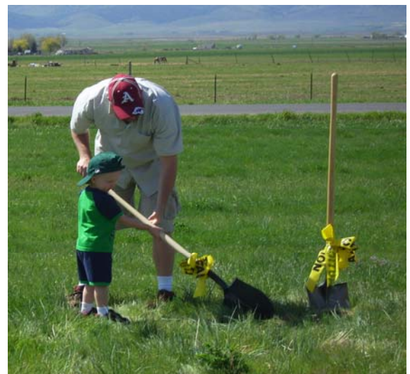
Malad Groundbreaking April 28, 2007 April